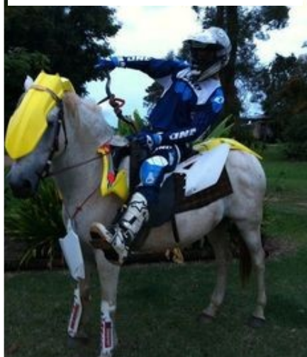
Solution for the high petrol costs